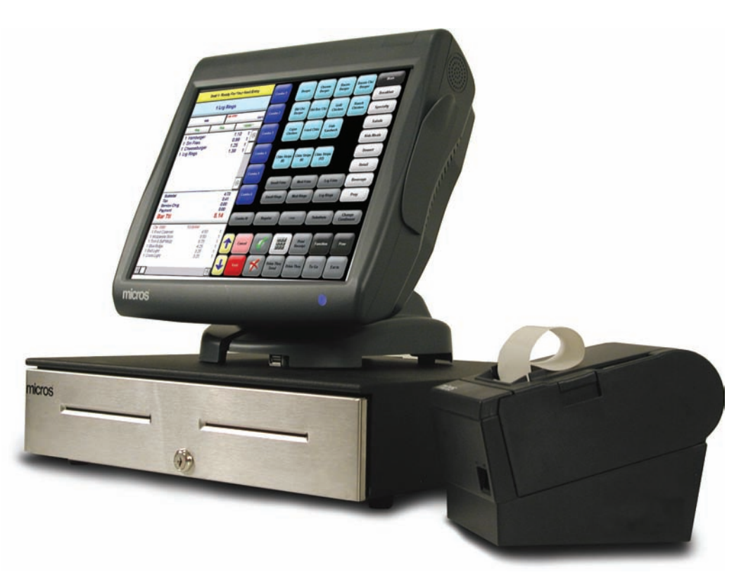
Technology is playing an increasingly important role in the management and operations of restaurants.