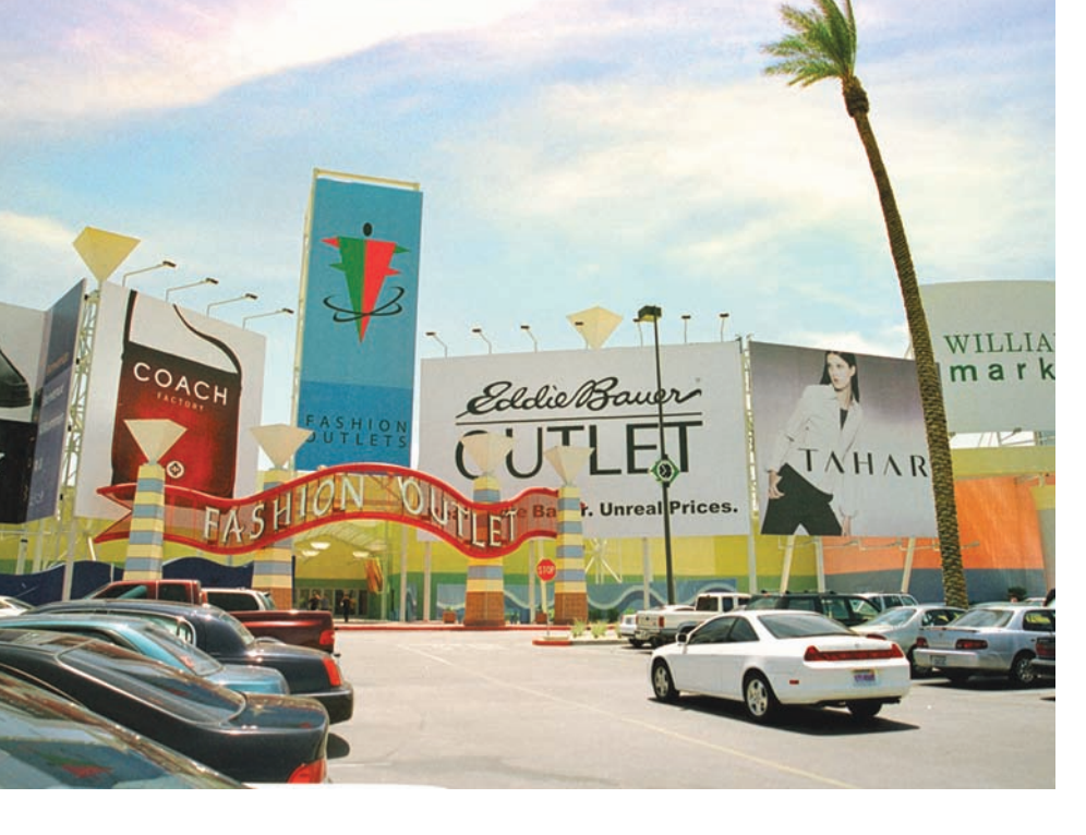
Many fast food establishments are located inside shopping centers giving customers convenient, if not always healthy, dining choices.

Efforts such as the McLean Deluxe, which relied on substituting a seaweed derivative for fat, have been replaced by a strategy of offering products such as chicken and potatoes that are, in themselves, low in fat. Besides their burgers, Harvey's also offers a lower-fat product that fits well with its skinless chicken product. Wendy's, too, offers a skinless chicken sandwich and baked potatoes—with or without fatrich toppings—as an alternative to french fries. So, whether consumers always choose them or not, alternative menu items are available, and more and more options are becoming available all the time.